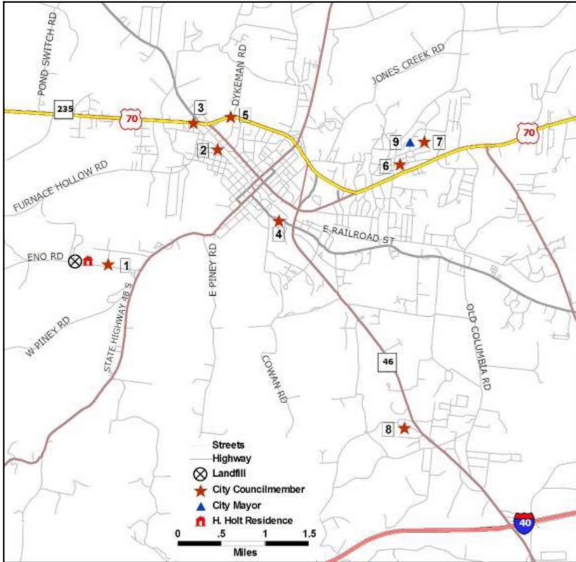
FIGURE 1 Map of Dickson City Officials and Proximity to Dickson County Landfill