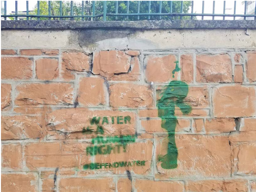
Street art proclaims “Water is a Human Right,” in Cape Town, January 2019. 2