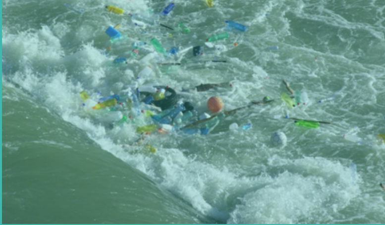
Figure 16. Plastic litter in Rome, Italy's Tiber River heads out to sea (2007).

of marine debris concentrations and maps of marine animals could help identify ocean areas that should be prioritized for clean-up efforts. Additionally, plastics surveys could be added onto planned marine organism studies; archived samples could be checked for plastic concentrations; old video and photographic footage of the deep sea floor could be analyzed; and remote sensing could be employed to identify existing plastic marine litter hotspots. 129 Web-based forums where interested parties can post and obtain information about plastic marine debris, such as the NOAA Marine Debris Clearing House, 130 also can help researchers identify hotspots.