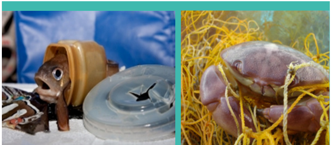
Figure 5. (Left) A Cusk eel hiding inside a plastic container off of Seal Beach, California. (Right) A crab entangled in a ghost fishing net in the coral reefs of the northwestern Hawaiian Islands (2005).

are already tiny—also can enter the ocean. Common sources of primary microplastics include microplastic spills from industrial processing sites or ships, 20 facial scrubs and cosmetic products containing plastic microbeads, 21 industrial spraying and scrubbing of boat hulls, 22 and plastic-based clothing. 23 Microplastics are ubiquitous in marine and coastal environments, and are a growing cause of environmental concern. 24