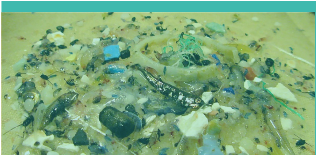
Figure 10. A sample of litter from the garbage patch in the South Pacific subtropical gyre (2011).